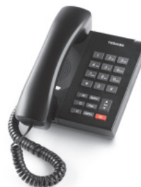
One programmable button