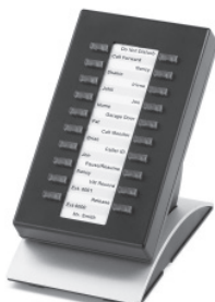
Add-On Module with 20 programmable buttons