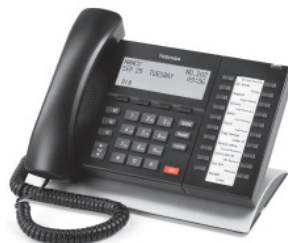
4-line Backlit LCD with 20 programmable buttons