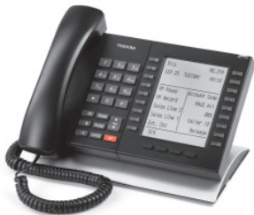
9-line Backlit LCD with 10 programmable buttons