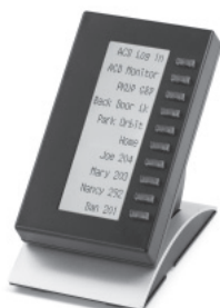
Backlit LCD Add-On Module with 10 programmable buttons