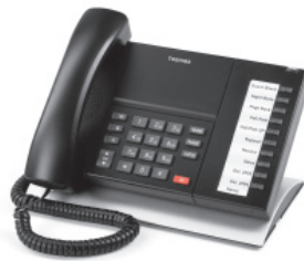
10 programmable buttons